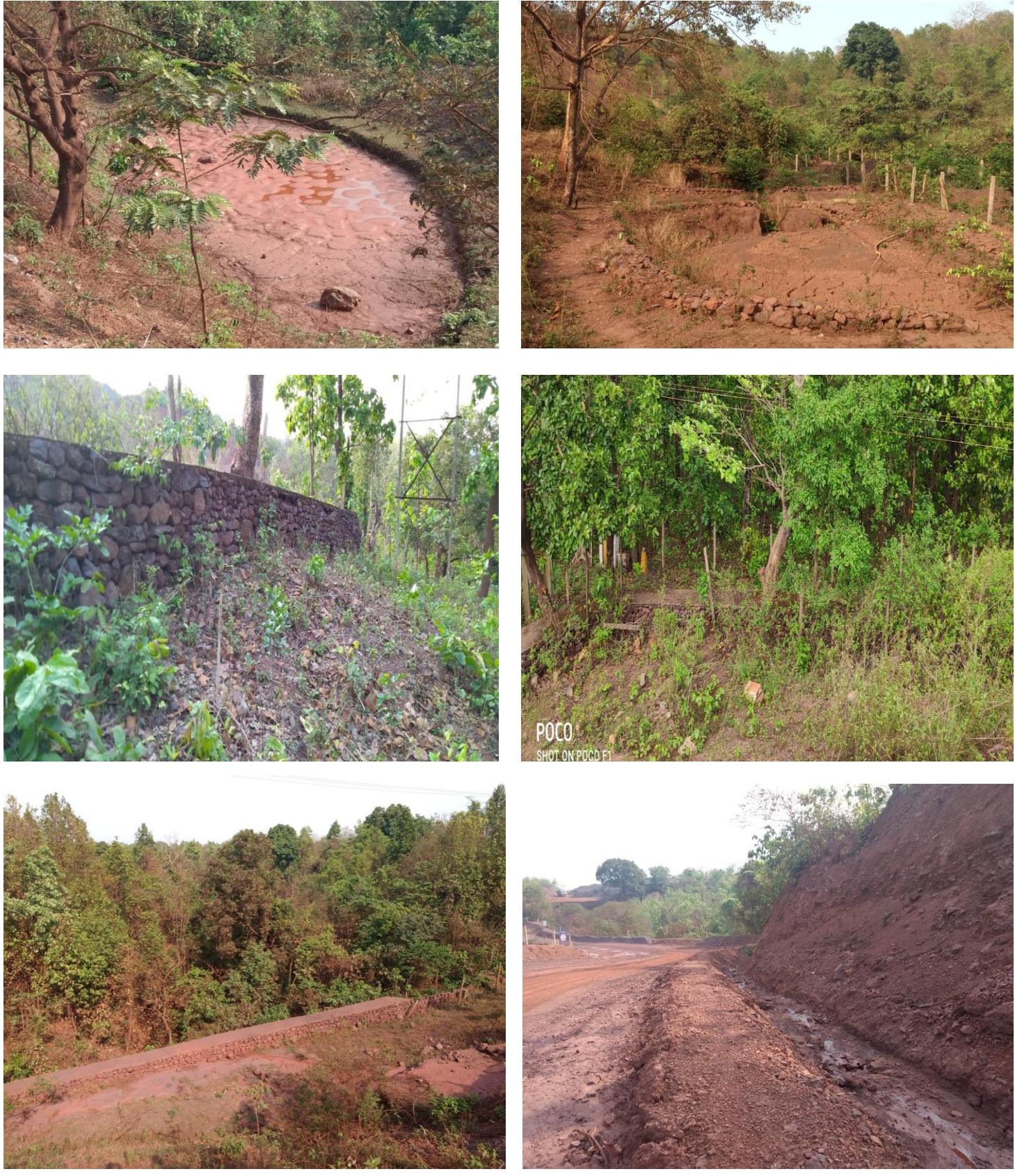
Photo showing Settling pit, Check weirs, retaining wall & garland drain Deojhar Iron Ore Mines of M/s Tarini Minerals Pvt. Ltd.